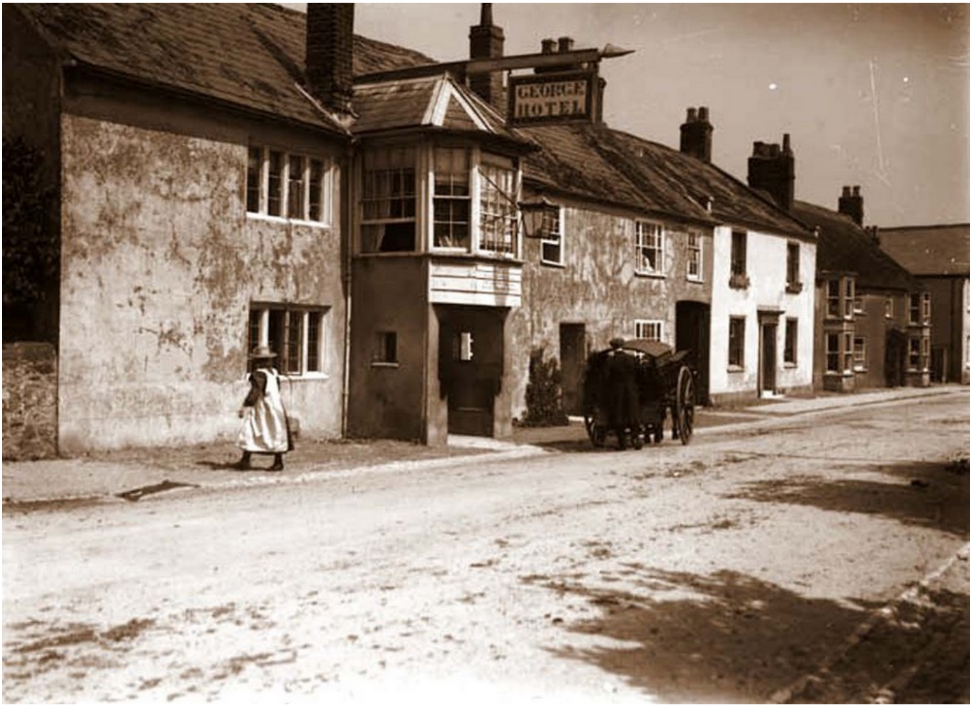
The George Inn c.1900