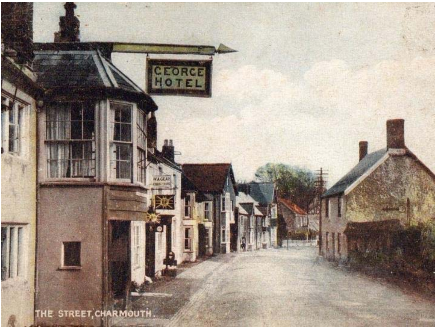
THE STREET, CHARMOUTH.